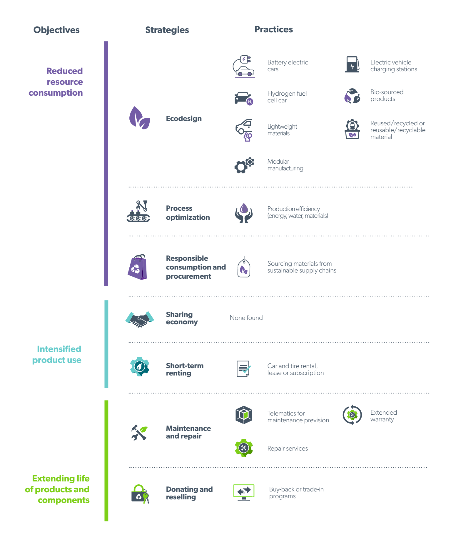
Figure 7-1. Circular economy objectives, strategies and practices found in the automotive manufacturing sector